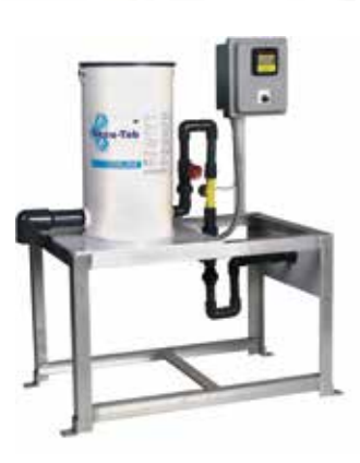
PowerPro MD chlorination unit using Accu-Tab chlorinator model 3150 as shown.

PowerPro Gravity chlorination unit using Accu-Tab chlorinator model 3075 with digital flow meter as shown.